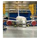
787: Its journey to the runway