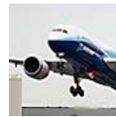
Boeing 787 first flight