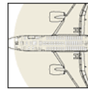
Dreamliner 101: A primer