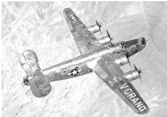
Consolidated B-24J Liberator bomber.

The remains of eight servicemen who went missing in action during World War II have been identified and returned to their families for burial with full military honors, the Pentagon announced Thursday.