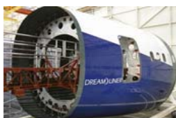
787's path to first flight